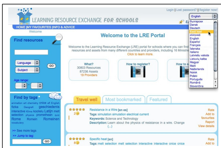
Fig. 1. The Learning Resource Exchange portal is available in different languages.

The quality of tags, like metadata, can be evaluated from two different perspectives: the validity of the metadata in describing the resources, and their usefulness in terms of searchability and the extent to which the metadata supports the retrieval of resources [8]. In this study, we are interested in how useful the user-generated tags can be for the learning resource “metadata ecology”. This term can be used to describe the interrelation of conventional metadata (e.g. LRE Application profile) [9] and social tags on the one hand, and their interaction with the environment, which can be understood as the repository, its resources and stakeholders, such as the managers, metadata indexers and the whole community of users.